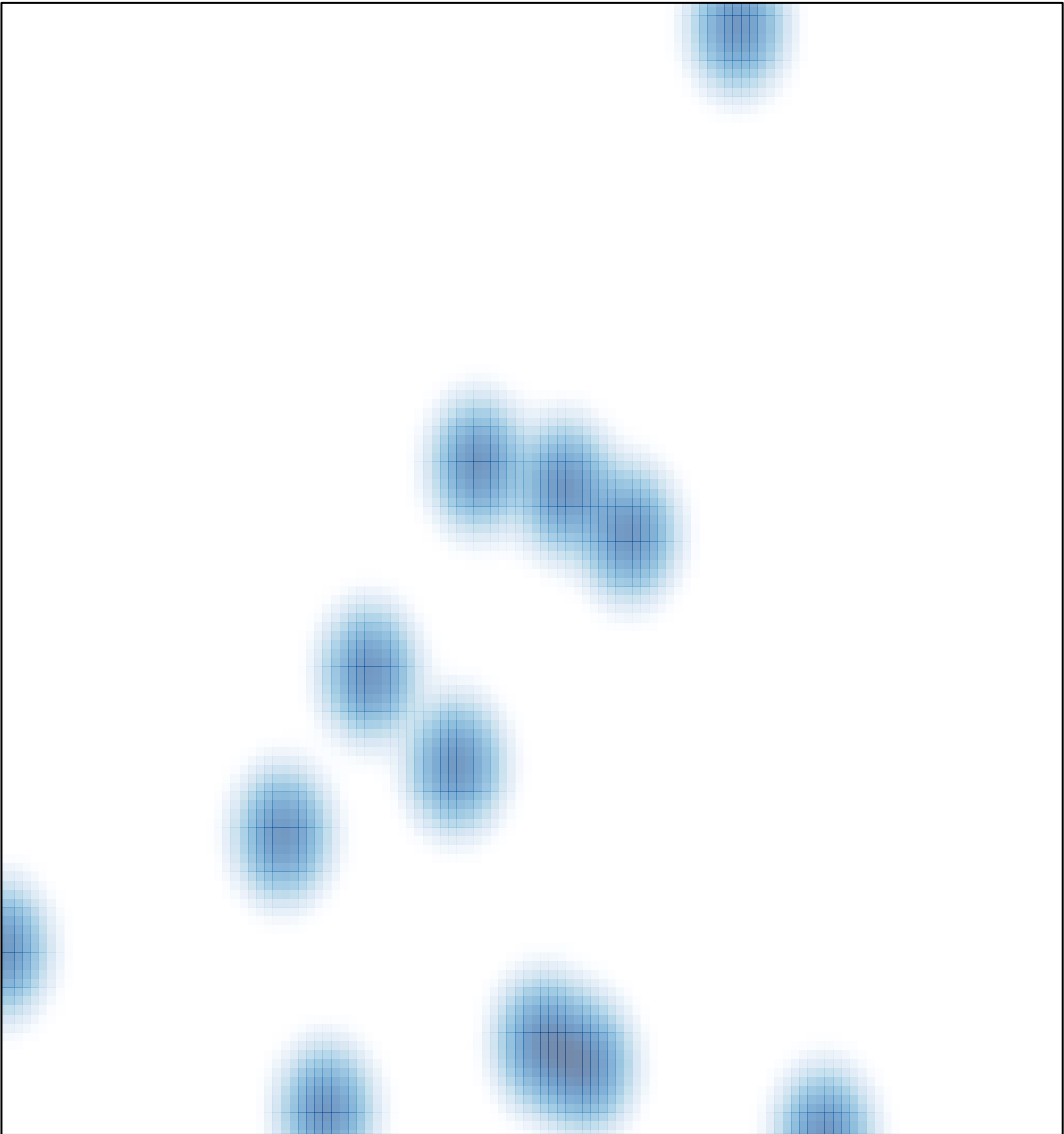
# features = 12 , max = 1